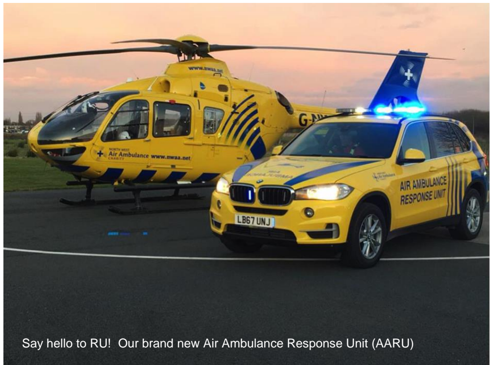
Say hello to RU! Our brand new Air Ambulance Response Unit (AARU)